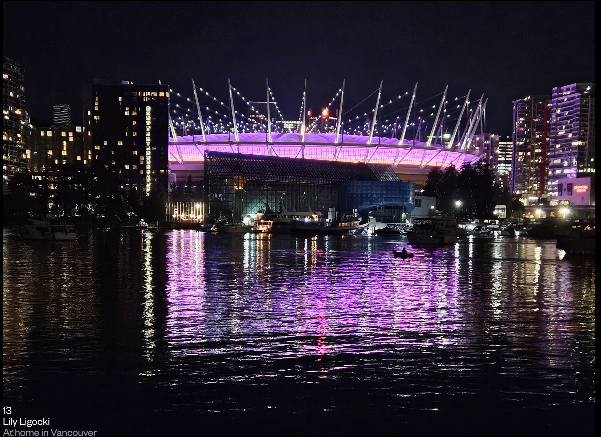
13 Lily Ligoeki At home in Vancouver