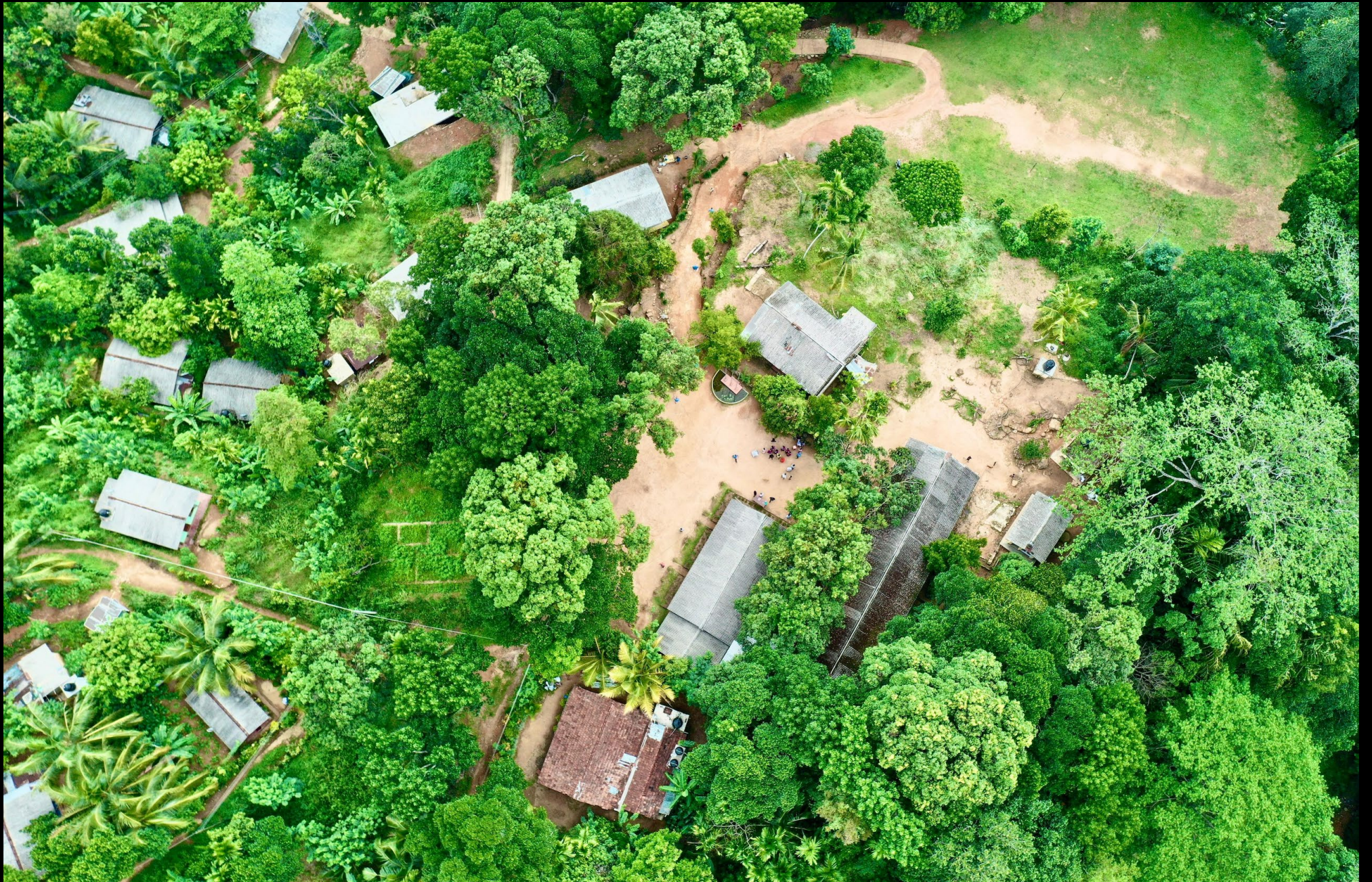
19 IFS Foundation Community Site Weralugahamula in Sri Lanka