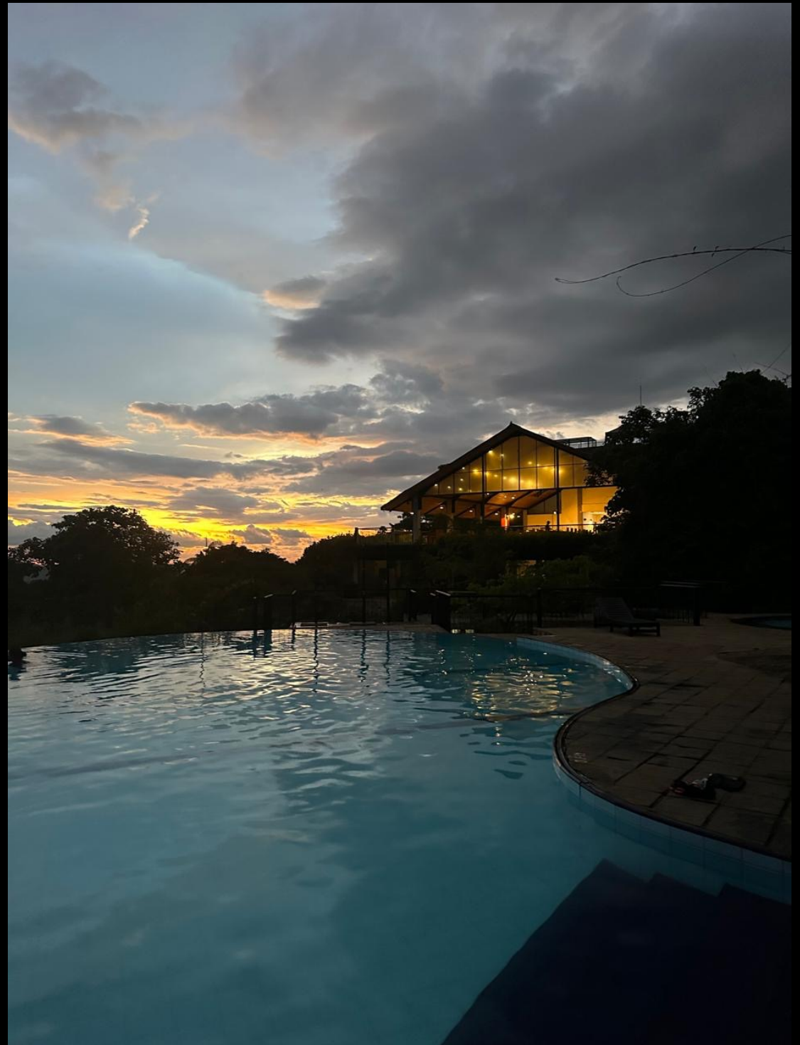
03 Fazal Shabdeen At home in Kithul Kanda